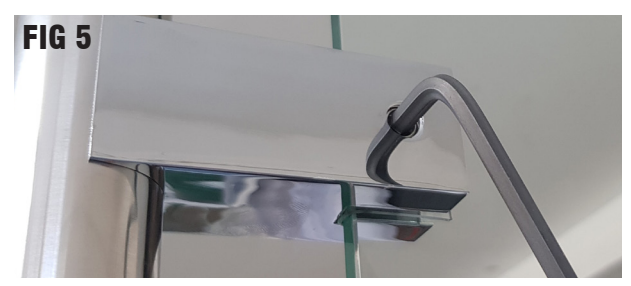
Ensure the rubber spacers are inserted in the lugs & secure to the shower screen.