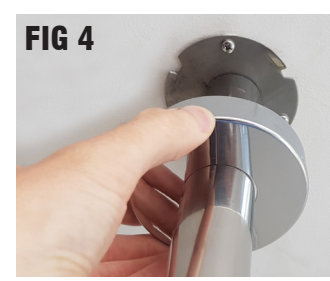
Slide the top cover up to the ceiling rose & turn anti-clockwise to lock